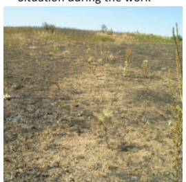
Situation after the destruction

Initiative for Environment and Local Development (IEDL) and the Forum for Civic Initiatives (FIQ) organized a meeting with the community of Bardh