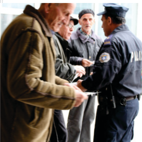
"Power comes with local people"