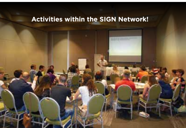
Activities within the SIGN Network!

Recently, FIQ has become part of yet another network, and that is the Balkan Green Foundation (BGF) , also a regional initiative created to advocate and promote sustainable development throughout Western Balkan.