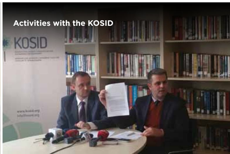
Activities with the KOSID